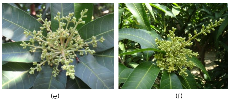
Figure 3 The normal ‘Mahachanok’ mango (a) and phytotoxic symptoms of panicles after PBZ foliar application for 4,000 and 2,000 mg/L PBZ at 15 and 30 DAP, respectively (b), 2,000 mg/L PBZ at 15, 30 and 45 DAP (c), 2,000 mg/L PBZ at 15 and 30 DAP (d), 3,000 mg/L PBZ at 15 DAP and 2,000 mg/L PBZ at 30 DAP and 45 DAP, respectively (e), and 3,000 mg/L PBZ at 15 DAP and 2,000 mg/L PBZ at 30 DAP (f)