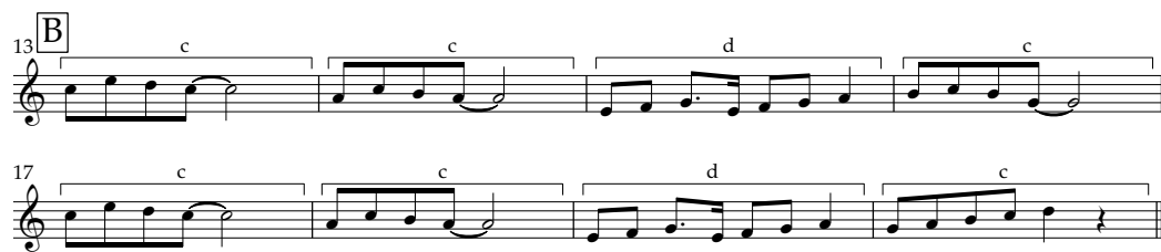
Figure 3. “大地回春,” B Section.

In contrast, the B section (theme B), comprising 8 measures, provides a distinctive departure from the A section’s characteristics. Here, the rhythmic dynamics are more pronounced, featuring eighth notes. The B section consists of two discernible motifs, divisible into one-measure phrases, represented as two sets of “c-c-d-c,” introducing rhythmic and melodic diversity into the composition. Despite these variations, the melodic range in the B section remains within the comfortable register established in the A section, from E4 to E5. The B section contributes to the composition’s overall structure by introducing a contrasting rhythmic and melodic palette.