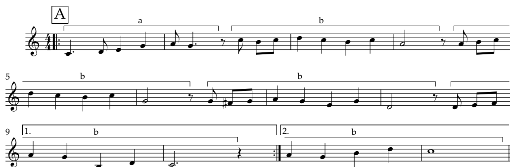
Figure 2. “大地回春,” A Section.

The Chinese folk song “大地回春” adheres to a structured musical form known as AABA. This form delineates the song into distinct sections, each with its unique characteristics. The A section (theme A), spanning 10 measures, serves as the foundational thematic material of the song. Within this section, recurring motifs are evident, further divisible into two-measure phrases, denoted as “a-b-b-b-b.” These motifs repeat multiple times, instilling a sense of familiarity and continuity throughout the composition. Melodically, the A section predominantly employs quarter notes, imparting a steady and grounded quality to this part of the song. The melodic range in the A section comfortably spans from the note B3 in the lower register to D5 in the higher register.