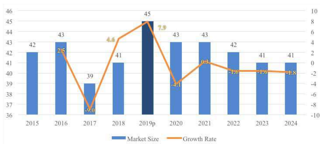
Figure 1. Size and growth rate of Thailand's comic market (2015–2025) (Units: in millions dollars, %).

The Korea Creative Content Agency (2022) estimates the size of the global webtoon industry as approximately 1.566 trillion won, with approximately 9,326 webtoon artists as of 2021. Analyzing the export of webtoons from South Korea to different countries, Japan and North America were the destinations with the highest numbers, accounting for 40.1% and 22.3%, respectively. Thailand accounts for 6.3%, which is a slight decrease from the previous year; however, it ranks fifth globally and is the top destination in Southeast Asia. The entire comic market in Thailand, including print comics, digital comics, and webtoons, stood at 45 million dollars in 2019 (Figure 1), with minor fluctuations yearly (Korea Creative Content Agency, 2020). However, the proportion of digital comics (Figure 2), including webtoons, grew from 4.7% in 2015 to 9.5% in 2019, and may reach 16.5% by 2024 (ibid.). Owing to the decline in the print comics market, the overall market size is predicted to decrease to 41 million dollars in 2024.