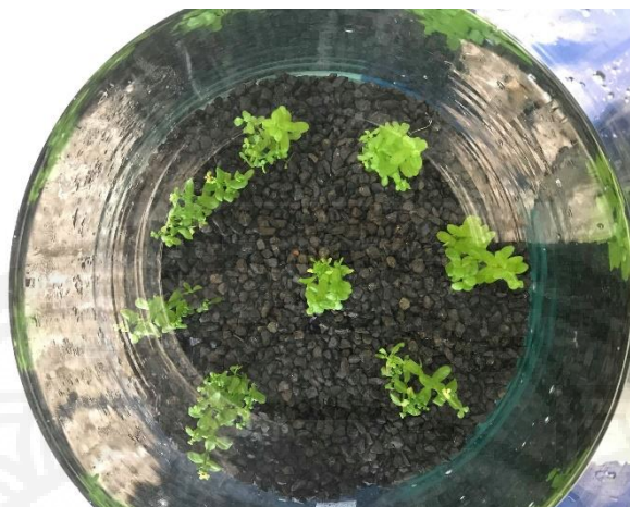
Figure 3 The characteristics of dwarf water hyssop acclimated in the aquarium for 4 weeks

acclimatization. The plantlets adapted successfully to aquatic environmental conditions and 100% survived with healthy, strong shoots and green leaves (Figure 3).