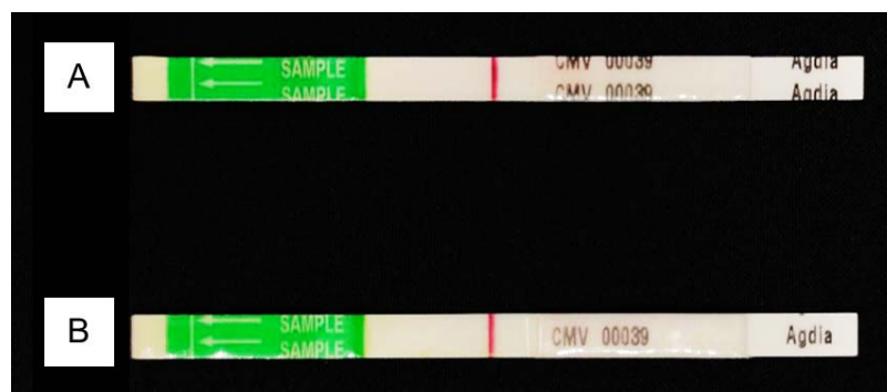
Figure 2: Result of pathogen detection by the Cucurbit Mosaic Virus (CMV) ImmunoStrip® test: Galia melon (A) and Orange Man melon (B).

After the melon seeds had sprouted and grown true leaves, leaf tip samples were taken to test for Cucurbit Mosaic Virus using the CMV ImmunoStrip® test, which is based on serology principles and uses antiserum linkage, or IgG bonding of the virus to colloidal gold particles, a reaction which is easily visualized by a change to reddish-orange color on the test strip. If the sample tested is virus-free, there will be only one reddish-orange band on the test strip, and if the