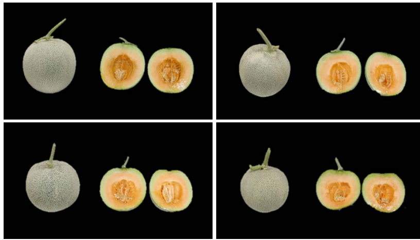
Figure 5: Mature fruit of Orange Man melon and fruit cut open showing flesh color harvested from tissue culture seedlings of different ages: fruit from 14-day-old seedling (control) (A), fruit from 10-day-old tissue culture seedling (B), fruit from 15-day-old tissue culture seedling (C), and fruit from 20-day-old tissue culture seedling (D)