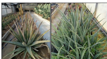
Figure 2 Aloe Vera in greenhouse cultivation

warm climate, with temperatures during the winter not falling below 8°C. Ideal growing temperatures are around 20-24 °C (Saleh et al., 2019). Aloe is a drought-tolerant plant but has problems in environments where waterlogging is present. Therefore, it needs a sub-acidic pH and water with low sodium content. These conditions can only be found in southern Texas, southern Florida, and southern California in the USA. Crops are also found in Mexico, Australia, Africa, and Central America. In Europe, they are found in southern Spain, Portugal, Greece, and recently in Italy. Typically, the leaves of plants grown in the Rio Grande Valley or South Florida weigh between 600 g and 1 kg. Each plant needs a space of approximately one square meter, so one hectare can accommodate between 10000 and 12000 plants (Figure 2), (Banerjee et al., 2018). Under normal conditions, each plant yields 15 to 30 kg of leaves per year. In commercial Aloe cultivation, insecticides and pesticides are not usually necessary, as the bitter taste of the sap is sufficient to eradicate insects and other possible predators. Aloe plants are more vulnerable during flowering, as during this time the sap leaves the leaves and moves to the stem and flowers and pathogens can attack it more easily (Banerjee et al., 2018).