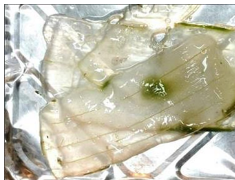
Figure 3 Aloe vera gel extraction

step is to wash the leaves using suitable methods so as not to damage the properties of the Aloe in any way. After the first general washing, a second step follows in which each leaf is scrupulously washed and cleaned by hand (Figure 3) (Yadav et al., 2020). The process of washing and cleaning the leaves removes aloin, an irritant substance found just under the skin. Finally, the peels are pulped and used as a natural fertilizer (Debnath et al., 2018). After washing and cleaning, the gel undergoes a stabilization process to maintain the quality and nutritional profile of the product. Once stabilized, the gel begins its journey to the packaging and production sites (Ibrahim, Al Sadah, Ahmad, Ahmad, & Naqvi, 2019). The leaf consists of a very thick green cuticle and an inner gel. If the leaves are not processed, the result is a greenish pulp with a bitter taste and rich in anthraquinones (Yohannes, 2018; Bhoje, Somkuwar, Sarode, Dubey, & Harke, 2021).