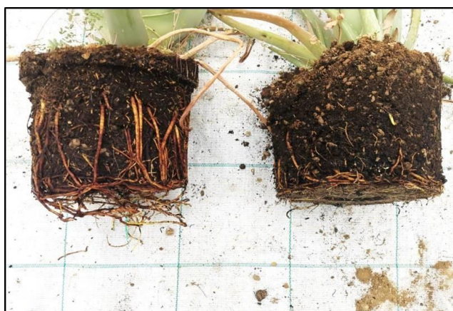
Figure 1 Aloe Vera roots growth details

Kumar, 2019). It is a genus of evergreen, shrubby, perennial or climbing plants, with flowers of different colours depending on the species (Prisa, & Gobbino, 2021b). The Aloaceae family comprises about three hundred and fifty varieties of plants all over the planet (Table 1) (López et al., 2019). In 1955, 132 species were catalogued in South Africa alone. The others are distributed in other parts of the African continent, Asia, the Caribbean, Spain, Central and South America, North America, and Mexico (Khan, & Siddiqui, 2020). A botanical distinction can be made by looking at the trunk (Figure 1) and the leaves. Aloe groups are identified as acauleas, subcauleas and cauleas (Prisa, & Gobbino, 2021c).