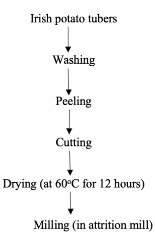
Figure 1. Flow chart for the preparation of Irish potato flour.

mesh size of 600 \mu m to obtain the Irish potato flour (Figure 1).