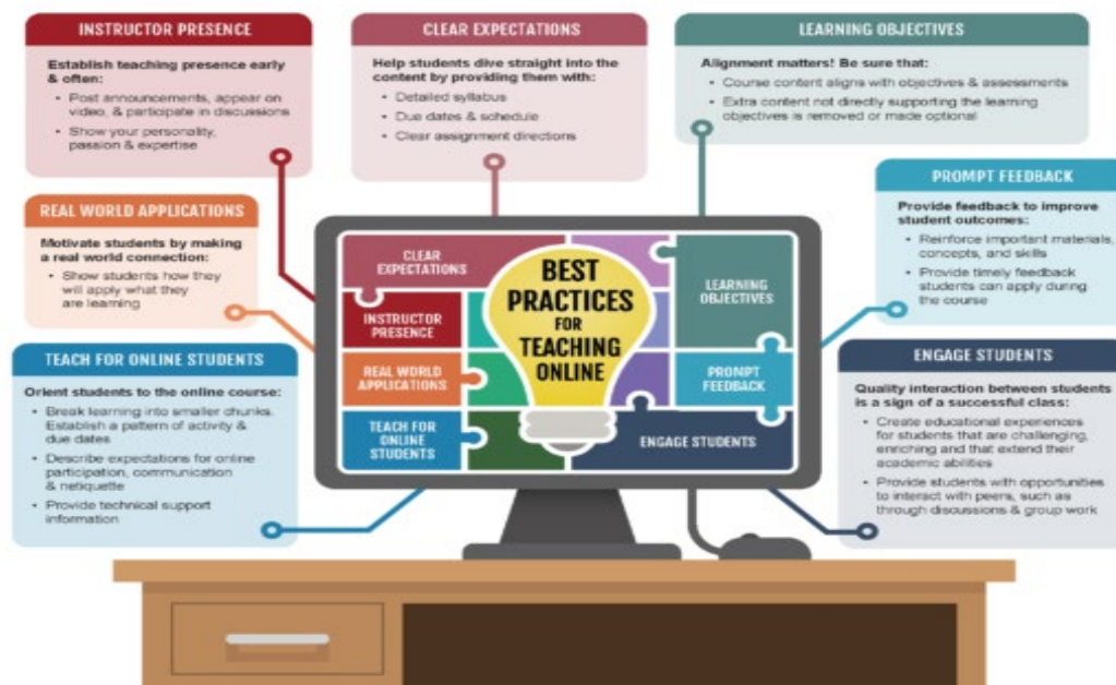
Figure 2 Best practices for teaching By Jessica Cole. September 10, 2018