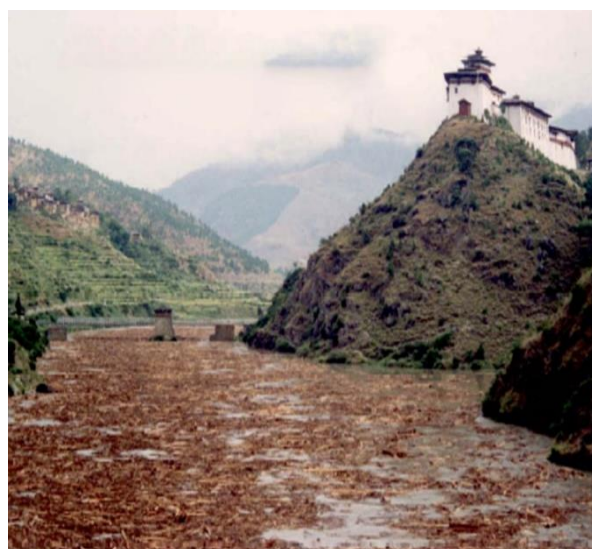
Figure 2: Flows of debris caused by GLOF in 1994 (Source: Department of Geology and Mines, Ministry of Economic Affairs).

along the large river valleys, the consequences of GLOFs would be severe and could impact on the nation as a whole, unless preventative measures are put in place. While a significant number of hydro-meteorological studies have been conducted on this subject, there isn’t one that specifically focuses on land use planning and the interventions required to adapt to a GLOF disaster. This is particularly important when considering the role of land use in planning the distribution of settlements and infrastructure. A well-planned settlement would not only respond well to a disaster but also have the inherent capacities to adapt to it. Human settlement encompasses many sectors such as land, environment, climate change, disaster, etc., and it is important that the spatial planning of human settlement addresses the threat from the GLOFs and incorporates adaptive measures in the planning process. This paper examines and compares the various existing national policies, strategies, legislation and relevant factors and sets out the findings, conclusions and recommendations for the preparation of development plans to adapt to and mitigate threats posed by GLOFs. The threats from the GLOFs have been an important consideration in all planning processes and a study on this subject will go a long way in ensuring that our settlements are resilient and sustainable.