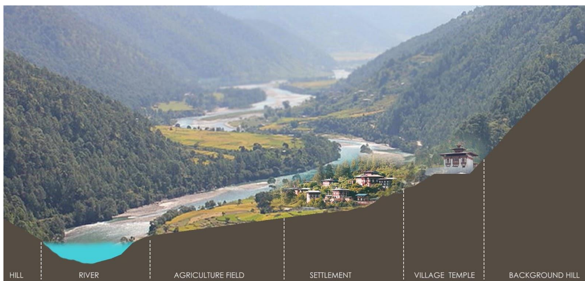
Figure 3: Hierarchy of Traditional Bhutanese Settlements (Illustrated by Authour)

For any land use planning, the Water Regulation of Bhutan 2014 mandates a compulsory transitional buffer of 100 feet long on both sides of a river where none of developments and building constructions is permitted. It is very likely that this figure of