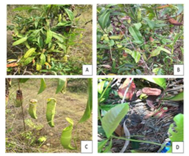
Figure 1. A. N. mirabilis var. mirabilis population. B. A pitcher plant N. mirabilis var. mirabilis. C. Upper pitchers N. mirabilis var. mirabilis. D. Lower pitchers of N. mirabilis var. mirabilis.

A total of 546 mosquito larvae belonging to two genera and three species were collected during rainy and dry seasons. Among these collections, larval of Tripteroides tenax were the highest in number (526) forming 96.34% of the total larval collection, while the total number of Tripteroides sp.1 amounted to 11 (2.01%), and Toxorhychites albipes to 9 (1.65%). Thus, the density of larval mosquitoes per pitcher amounted to: Tripteroides tenax , 5.26; Tripteroides sp.1, 0.11; and Toxorhychites albipes , 0.09. The abundance of larval mosquitoes differed between rainy and dry seasons; their abundance was significantly higher during rainy season than during dry season ( x^2 = 43.93 , P = 0.01) (Figure 2).