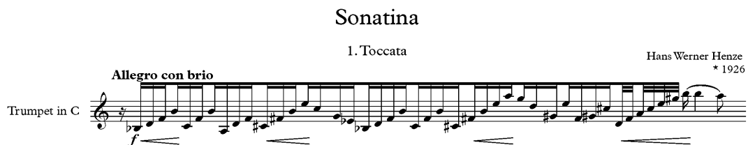
Figure 2.4 Main motives of the first movement, Sonatina for Solo Trumpet , Schott Music Edition, 1976.

Henze's Sonatina for Solo Trumpet is full of the most technically difficult and musically challenging passages in the piece. The work has three movements; the first movement, Toccata is marked Allegro con brio , Henze used the motive in groups of four sixteenth notes and three sixteenth notes. This is the main motive of the movement. In the first movement, he used the dynamic contrast to make the piece more interesting. This movement is unmeasured because, Henze himself wanted to make the movement go forward. (McGlynn, 2007)