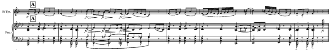
Figure 2.2 The theme of second movement, Concerto in E-flat Major, edited by David Hickman, Hickman Music Editor, 2005.

start from measure 17-32 in key of C-flat major and a modulation back in measure 27-30 to the dominant of A-flat in bars 30-32. The A' section start from measure 33-40. The short coda in measure 41-50 begins like the transition section but cadences in the familiar manner in bar 46 and resolve to the final tonic.