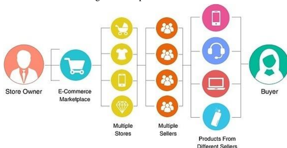
Figure 2: The basic structure of the marketplace.

Some generally accepted strategic principles, previously approved in the traditional enterprise management scheme, are becoming obsolete. Companies involved in various forms of collaboration on the basis of platforms consider the use of technical insights rather than marketing research and determination of competitive advantages based on the traditional MBA approach as the main development tools. In theory and practice of the global economy and management, the uberization model has a fundamentally different institutional format, the content, mechanisms, factors, and risks of which require a systematic study at the present stage. The content and organizational mechanism of the work of the uberization business model by the authors have already been described in detail in earlier studies (Gurina, 2019). In the framework of this article, the authors decided to touch on the technologies and tools that ensure its functioning. In particular, the fact that the uberization model is based on mediation in the form of a marketplace, but has some organizational features. Consider the basics of the functioning of marketplaces.