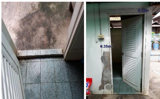
Figure 5: toilet and house before remodeling