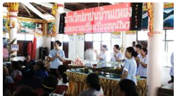
Figure 2: Prachakhom activity