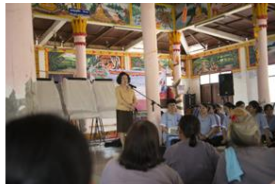
Figure 1: First day on-site activities