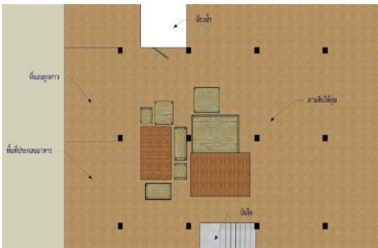
Figure 4: Example of toilet and house design