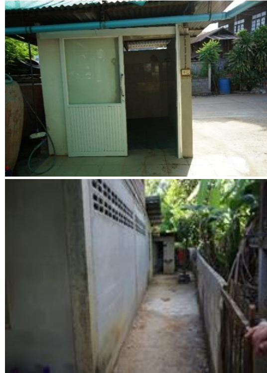
Figure 6: toilet and house after remodeling