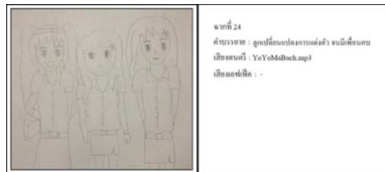
Figure 3. Defined outline

Defined outline (Storyboard) is defined as the image into the sequence of the story overview of work to do if anything happens to be solved can be modified to change (Figure 3).