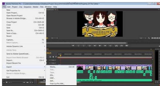
Figure 6. Develop animation