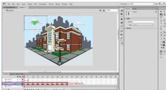
Figure 5. Draw background with software