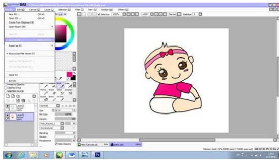
Figure 4. Drawn characters with software