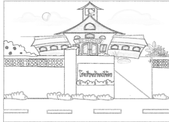
Figure 2. Design background of school

to the atmosphere, as well as the character of a different color and lighting, shall mood and make the audience understand the story to offer (Figure 2).