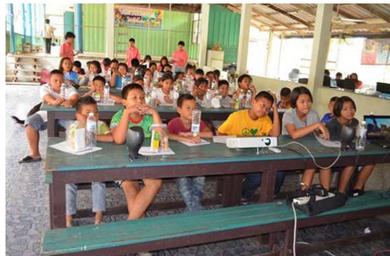
Figure7. Teaching with animation to the sample group

The animation was developed to be used as teaching materials to teach for the sample consisted of 50 by selecting a sample of student's grade 4-5 at Wat Don Sali School, Tumbon Don Yai, Aumpur Bangpae, Ratchaburi Province (Figure 7). They were drawn using cluster sampling techniques. After that we measure achievement learning from the pretest and posttest with quiz sufficiency of 10 items by switching the question of the pretest and posttest (Sumitra, 2014). Questions pretest and posttest of finding the ICO from 5 experts that the questions have IOC value greater than 0.5 and we evaluate satisfaction of animation (Terada & Adisai, 2009).