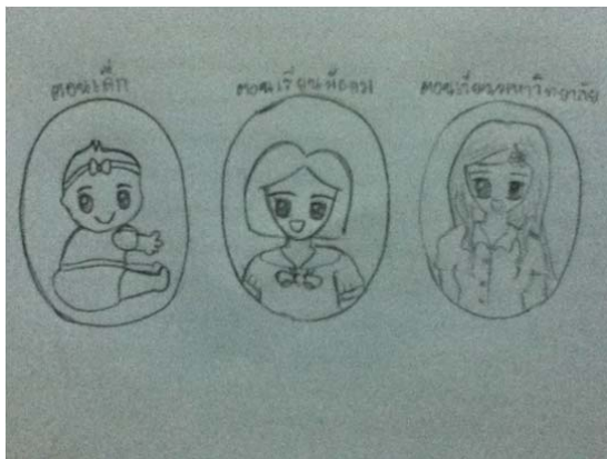
Figure 1. Character design

Character Design is the process of drawing characters on paper to simulate the character of the imagination. The characters are extremely important to make the animation look more attractive. The character design attempts to make the characters come alive in both appearance and attire (Figure 1).