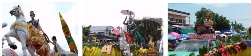
Figure. 4 Rocket Festival parade in Wiang Khuk in 2012, displaying the main characters found in the local legend; (left) Phadaeng Nang-Ai, (middle) Pangkhi, (right) the King of Toads

Another folk legend, Phadaeng and Nang Ai , appears in Rocket Festival parades. Each village must choose a young couple who ride on a figure of a white horse to represent Phadaeng and Nang Ai. Phangkhi as the son of Phaya Nak also rides a horse and is dressed like a prince in the parade, followed by Phadaeng and Nang Ai. At the same time, the activity is fun and interesting because of beautiful folk legend.