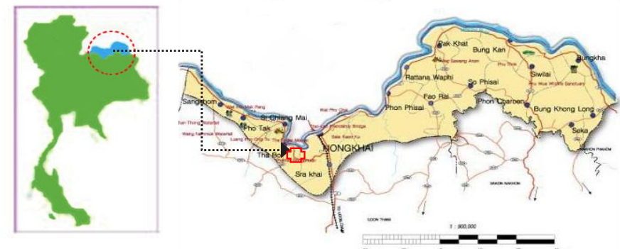
Figure. 1 Wiang Khuk's location