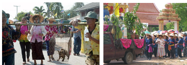
Figure.3 (left) The hae nang maew in the Rocket Festival parade. (right) The parade is no longer to pray for rain but for entertainment.

According to the above description, the rain ritual may be the original source of praying for rain. But villagers combine it with construction of the legend according to their needs in daily life, and the entertainment components have been enhanced in their social memory along with the development of rural society. The original rituals and appeals for rain are overshadowed by entertainment, parades, music and aesthetics.