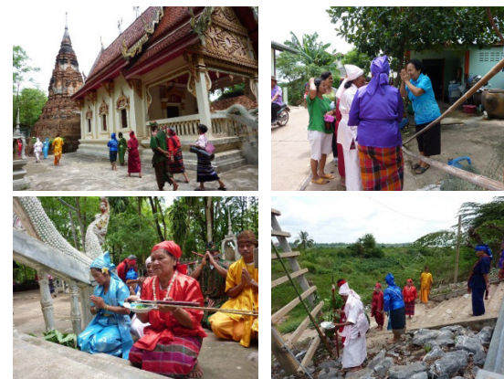
Figure. 6 (left1) The ancient chedi at Wat Theppon indicates the long history of Wiang Khuk. (left 2) The spirit mediums (Chao thep) were greeted on the way back to Wat Saosuwan by some villagers. (left 3) The worship of the Buddha ancestors by the leader of deity members who dresses as a man, in front of Wat Theppon, (right) After the last rite, the rocket competition could formally begin.

All of the above people addressed the issue that villagers would acquire a collective identity through preparing and participating in the floats. Obviously, these elites played an important role in enhancing the functional memory of the Rocket Festival. Through their efforts, many villagers voluntarily joined the activities and contributed their efforts. Such behavior had a greater social function and enhanced the social memory of the festival. The activities integrated the resources of each village, strengthened villagers’ cooperation, enhanced interpersonal relationships, and increased community harmony through the endeavor of authority figures. This is also an old educational method handed down from generation to generation in order to let children learn devotion, patience and methods of solving problems through participating in the festival, and then pursue a collective identity.