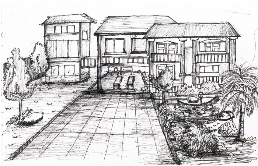
Figure 1. Learning area of the homeschool group