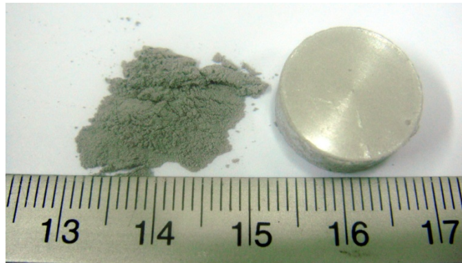
Figure 3.1 Photograph of aluminum powder and aluminum pellet

The aluminum powder (99.999% purity, American elements, US) and average size of 30 \mu\text{m} was pressed by a hydraulic with a pressure of 100 bars to obtain the aluminum pellet with a diameter of 15 mm and 4 mm thick. Figure 3.1 show the photograph of aluminum powders and aluminum pellet, respectively.