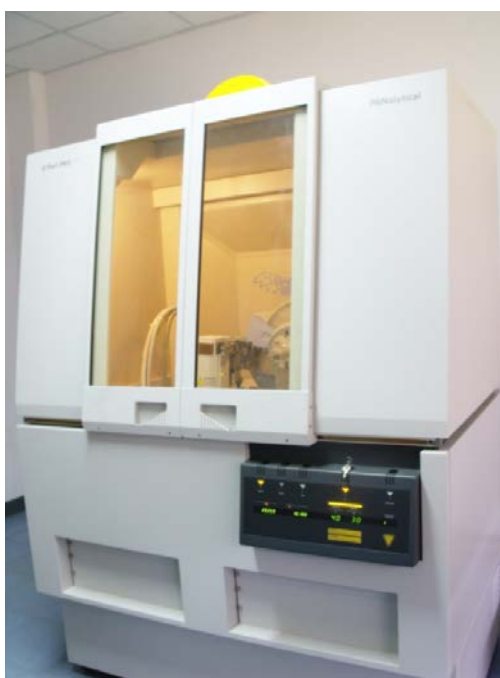
Figure 3.5 X-ray diffractometer

The crystalline phase of the synthesized carbon nanoparticles were identified by X-ray diffraction (XRD, PANalytical's X'Pert PRO) using CuK radiation ( \lambda = 0.15418 nm) over the 2\theta ranges of 20^\circ - 60^\circ . The XRD data were recorded with a resolution of 0.01^\circ . The operating voltage and current are 40 kV and 30 mA, respectively. The photograph of XRD is shown in figure 3.5.