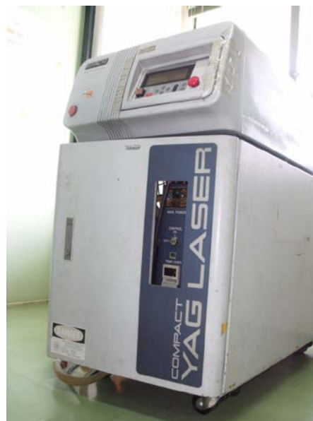
Figure 3.2 Photograph of the Nd:YAG laser used in this study

The Nd:YAG laser (MIYACHI : ML-2331B) was used in this study with a wavelength of 1064 nm. The laser output energies were ranged from 0.3 to 50 J/pulse. The pulse repetition rates were ranged from 1 to 50 pulses per second (pps). The pulse durations were varied from 0.1 to 20 ms. Figure 3.2 shows photograph of the Nd:YAG laser used in this study.