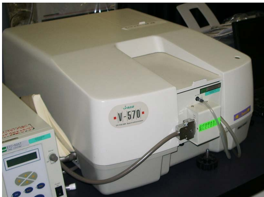
Figure 3.6 UV-visible spectrophotometer

The prepared carbon nanoparticles dispersed in each liquid were used for the optical absorption measurements. The optical absorption spectra in the wavelength range 190 to 700 nm were recorded at room temperature using a UV-visible spectrophotometer (Jasco, V570). After setting the deionized water as background, a small amount of the collected suspension (containing ablated alumina nanoparticles) was decanted into a quartz cuvette with a path length of 10 mm. The photograph of UV-visible spectrophotometer is shown in figure 3.6.