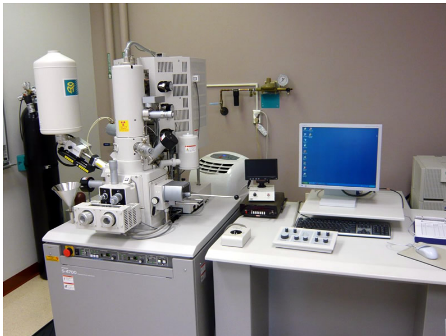
Figure 3.4 Field emission scanning electron microscope (FE-SEM)