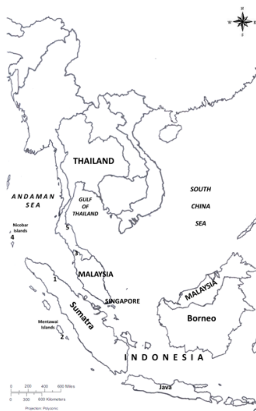
Figure 3. Distribution of Tectaria kehdingiana (Kuhn) M.G. Price: 1-4 show the previous distribution, 5 shows the present finding 1. Langkat, north Sumatra 2. Mentawai Islands 3. Wang Kelian, Perlis, northern peninsular Malaysia 4. Nicobar Islands 5. Nakhon Si Thammarat, Peninsular Thailand.

Island and the nearby small islands (Luerksen, 1882; Baker, 1891; Holttum, 1991; Chandra et al., 2008; Fraser-Jenkins, 2012), this fern species also occurs in Wang Kelian Heritage Trails , Perlis State Park, northern peninsular Malaysia (Rusea, Latiff, and Jaman, 2004) and in lower Peninsular Thailand as is reported here. As of now, Klong Klai Ranger Station, Khao Nan National Park, Nakhon Si Thammarat Province is the northernmost station of this fern species. The present distribution pattern of this Tectaria species (Figure 3) may be related to the theory of continental drift. According to this theory, Sumatra Island was formerly unified into peninsular Thailand and Peninsular Malaysia, but it is now the western part of the Indochina subcontinent (Metcalf, 1988). A small population of less than 20 mature individuals was observed at Wang Kelian Heritage Trails , northern Peninsular Malaysia (Rusea, Latiff, and Jaman, 2004). Tectaria kehdingiana is regarded as a very rare species on Nicobar Islands (Chandra et al., 2008; Fraser-Jenkins, 2012). In Thailand, approximately 50 mature individuals were found in Khao Luang and Khao Nan National Parks, Nakhon Si Thammarat Province. So far, five natural habitats are known; no information about the status of the population on Sumatra and Mentawai Islands