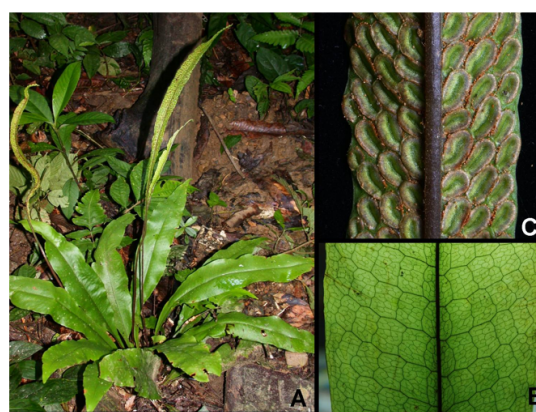
Figure 1. Tectaria kehdingiana (Kuhn) M.G. Price: A. natural habitat near Krung Ching waterfall, Khao Luang National Park, Nakhon Si Thammarat Province B. part of sterile lamina showing pattern of venation, C. part of fertile lamina showing sori and indusia.

Rhizome short, erect, bearing a tuft of fronds at apex, scaly; scales gradually narrowing from base towards apex, up to 3.75 mm long, shining brown with paler margin, the margin hairy. Fronds dimorphic, lamina simple. Sterile fronds : stipes castaneous, to 6.6 cm long, with short white hairs; lamina 29.0–48.0 x 4.7–6.7 cm, elliptic-oblong, apex acute, base cuneate, margin entire, glabrous on both surfaces except few short hairs on midrib or main veins beneath, texture chartaceous to subcoriaceous, venation reticulate forming many areoles and areolules with free included veinlets, veinlets simple or forked. Fertile fronds : stipes to 38 cm long, with short white hairs; lamina 30.0–38.1 x 1.7–2.1 cm, elliptic-oblong, apex acute, base cuneate, margin subentire to undulate, veins forming two rows of areoles with free included veinlets, veinlets simple. Sori large, one to each areole, terminal on included veinlets, covered throughout