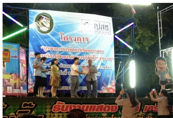
Figure 4. Academic Merit Based Learning