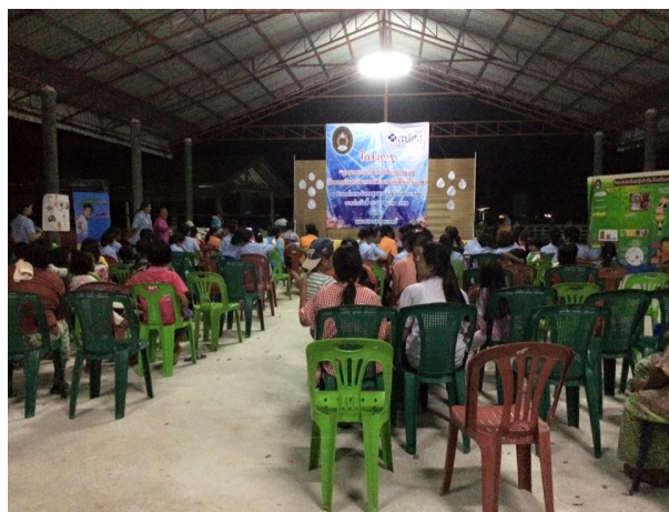
Figure 5. Community Based Learning