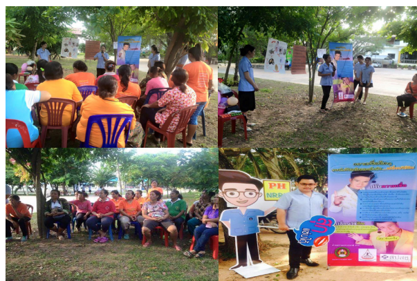
Figure 3. Knowledge Station Based Learning