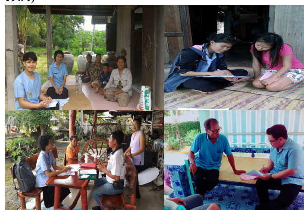
Figure 2. Family Based Learning