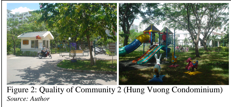
Figure 2: Quality of Community 2 (Hung Vuong Condominium)

which nearly 50% are foreigners and the rest are Vietnamese 6 . Livelihoods of residents are quite diverse including businessmen/women, non-state sector employees, retirees, artists, etc., whose income is from upper middle to high in the city stratum. Inside the complex, there are 9 condominium buildings and different neighborhood facilities like parks, playgrounds, toys, stone-chairs along internal alleys, etc., creating a very good living environment for residents. It is also enclosed with a fence and a 24-hour security gate in front creating a very high security neighborhood. (See Figure 2)