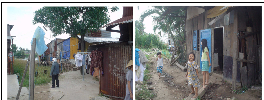
Figure 1: Quality of Community 1 (Tu Dinh Catholic parish)

The first community selected is Tu Dinh Catholic parish in Ward 15, Go Vap District (called Community 1 in this paper). It has 470 people living in 76 households 4 . People live along the Vam Thuat River and their main livelihoods are fishing, vegetable plantations, and small trade such as selling fish, vegetables, food, etc. at the community market. The community has poor neighborhood quality and substandard living conditions. No public facilities are available and most alleys regularly suffer from stagnant water. Garbage is thrown on alleys, into rivers and lakes, or even into drainage systems causing an even more serious problem with stagnant water in rainy season. Children have absolutely no playground, thus they usually play around community alleys, which are dirty and unsafe due to motorbike traffic. (See Figure 1)