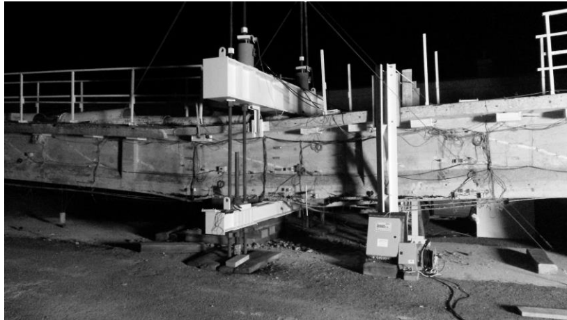
Figure 2. Definitive break of the beam.

The carbon fiber plates have a positive local effect preventing cracks from widening. Without strengthening plates, the size of the cracks measured in section S4 on the underside of the beam's heel were practically identical, if not greater, than those measured on the side of the heel. After strengthening, once the load was greater than 200kN the cracks measured on the underside of the beam's heel were smaller (up to - 68%) than the cracks on the side.