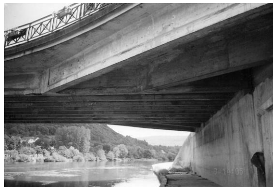
Figure 1. The upstream edge prestressed concrete bridge beam of the viaduct from Clerval.

The Viaduct over the River Doubs at Clerval using PPCBBs was built between 1952 and 1954 (see Figure 1). It suffered from waterproofing and concrete injection defects which caused corrosion of the prestressed cables. As this reduced the load bearing capacity of the structure, it was demolished and rebuilt on 2002.