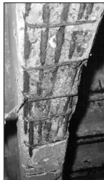
Figure 2. Reinforced concrete beam: advanced corrosion of the steel reinforcements, reduction of the diameter and fracture of the stirrups, in some areas, due to the corrosion by chloride ions.

The results of the laboratory tests performed on a large number of concrete samples extracted from the corrosion affected construction elements, showed the following: