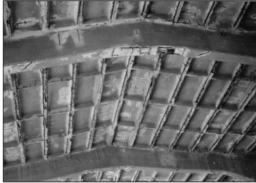
Figure 1. Reinforced concrete roof elements: cracking and spalling of concrete cover; uncovering of the steel reinforcements.